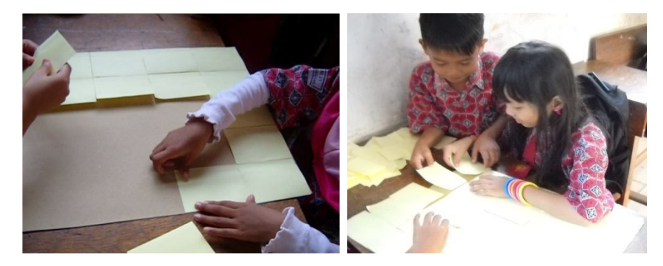
Figure 2. Students cover the baking tray

In the third activity, the students had to compare baking trays that can be put more cookies. It is expected that they can use the unit to compare. In this lesson, students are able to use their own unit to cover the shape in comparing the area. They can partition the region and structure the units into arrays. However, some students choose unit that physically resemble with the region they were covering. They used different units for different baking tray. In this manner, they only focus on the process of repeatedly using a unit and it seems they did not use the unit to compare. It might be because the question is which baking tray that can be put more cookies. Therefore, they did not pay attention to the size of baking tray. The question should be which baking tray is bigger so that they can think how to compare by using same kind of units. Some students were not aware of gaps and overlap in covering. They ignore the leftover paper and count all units include the leftover parts as area. In this level, these students did not get what is the area since they only focus on counting the unit. Students' work is in the following figures.